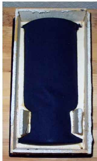
Inside of case with insert removed.